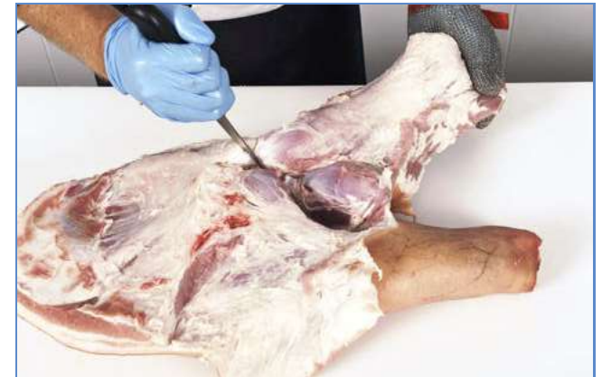
3 ... back to expose the humerus.