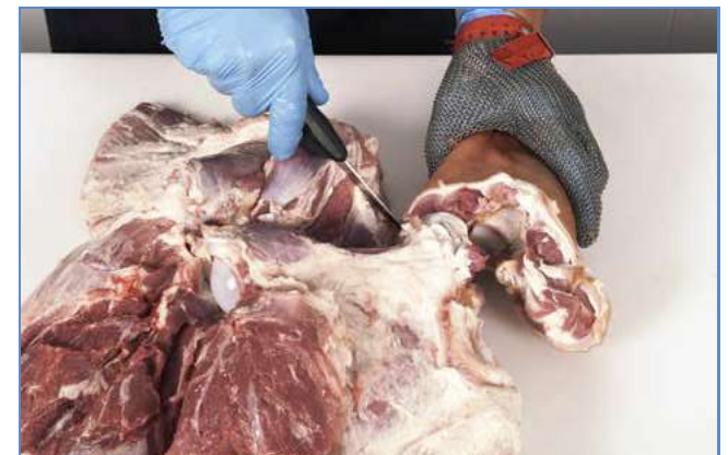
6 Remove the shank and ...