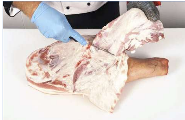
2 Seam cut the brisket muscle and fold it ...