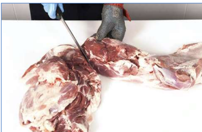
10 Cut between the feather and blade to split the shoulder in two.