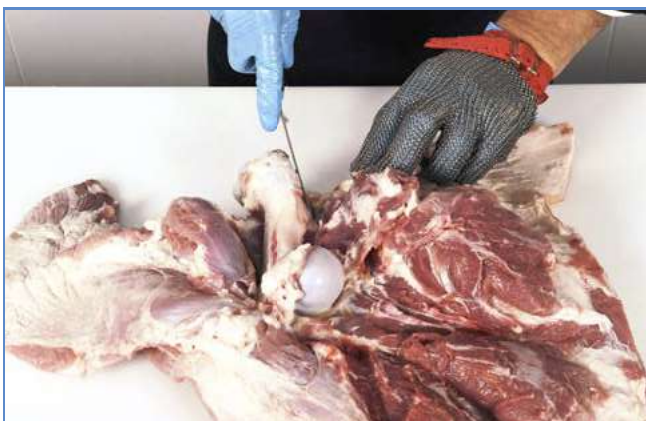
7 ... humerus.