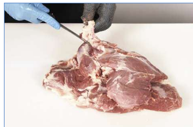
12 Trim the remaining Feather and LMC, including additional small muscle groups of excess fat and gristle.