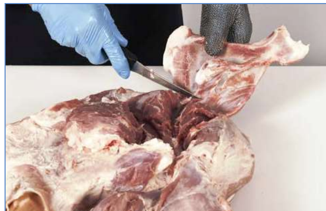
5 ... and remove the blade bone.