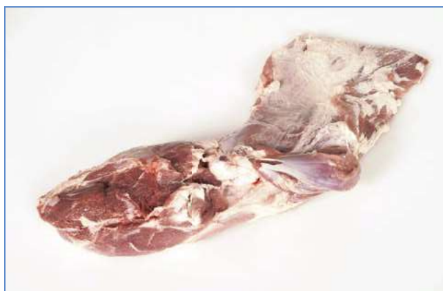
11 Blade and Brisket muscle.