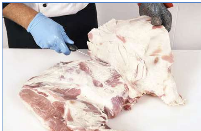
8 Remove the rind including excess fat.