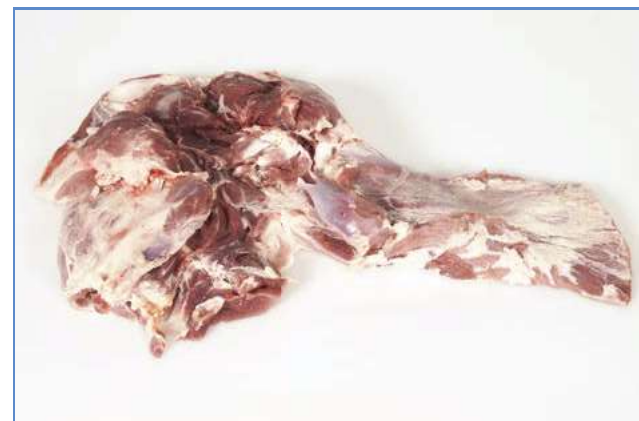
9 Boneless, rindless shoulder of pork.